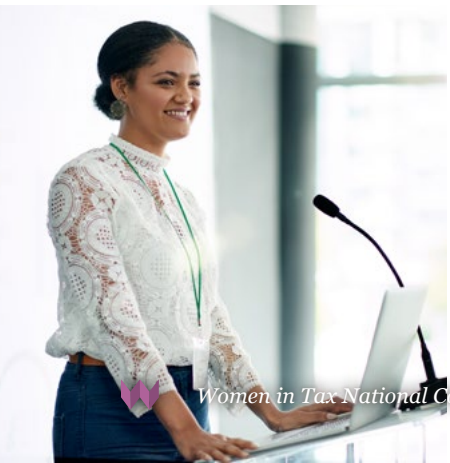
Women in Tax National Congress